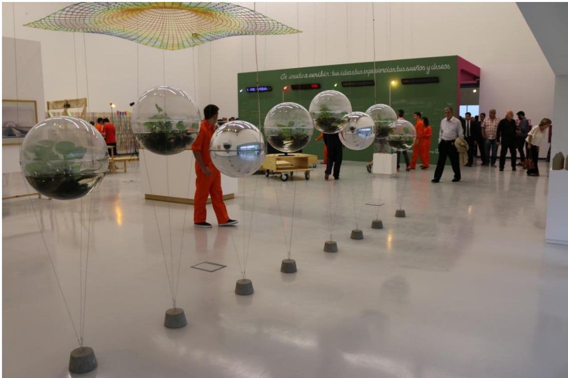
Exhibition at the Museum of Contemporary Art MAR, Mar del Plata, Argentina - 2014/2015