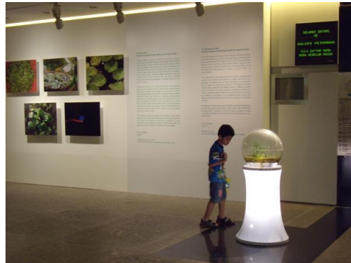
Exhibition – Galeri Petronas, Kuala Lumpur, November 2008