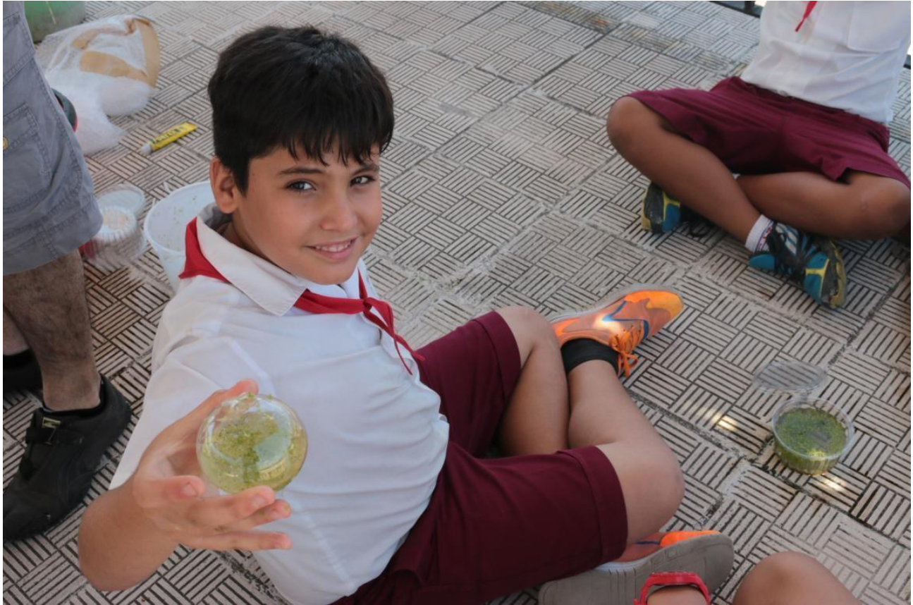
School in Havana,Cuba 2015