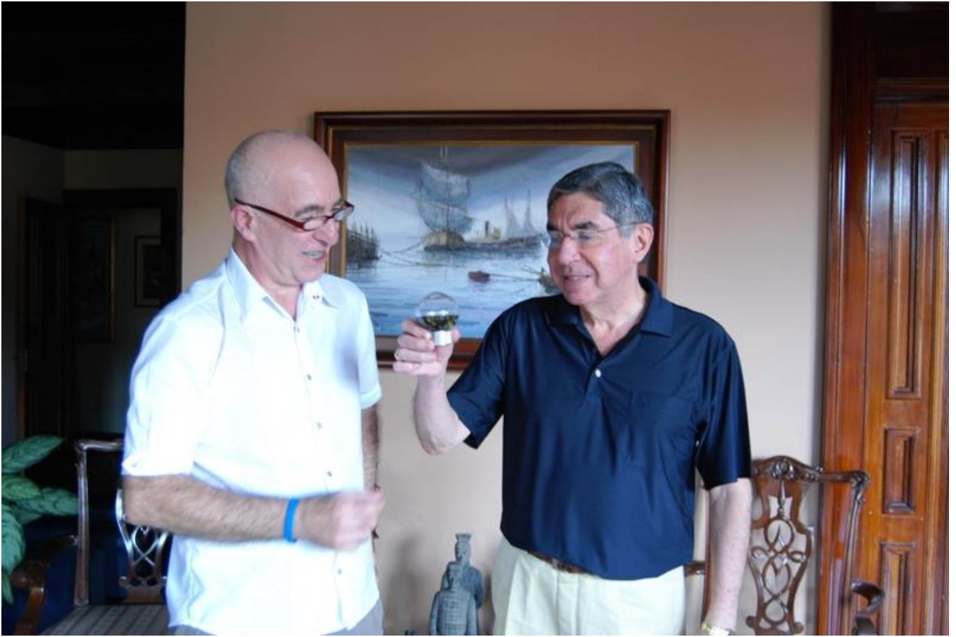
Costa Rica's Ex-President Oscar Arias Sánchez , receiving the Mini Biosphere, the World in his hands. He was awarded the Nobel Peace Prize in 1987