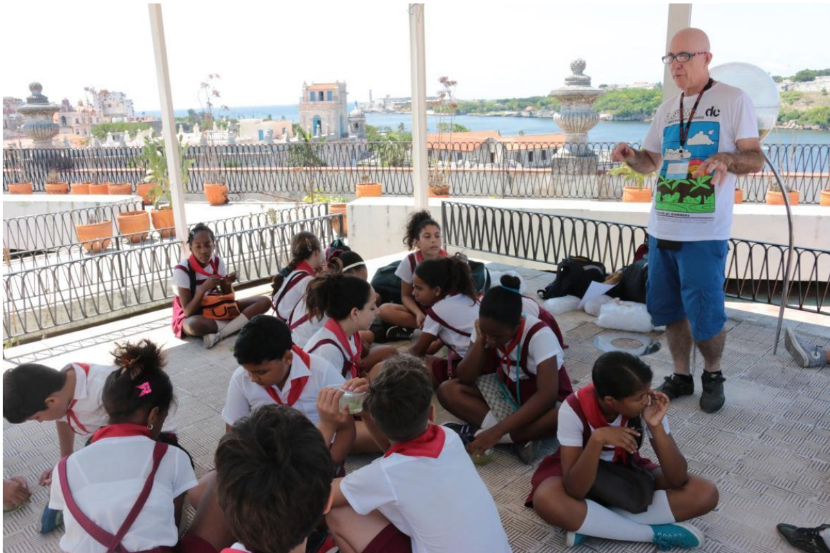
School in Havana, Cuba 2015