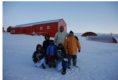
Esperanza Base Sea Ecosystem