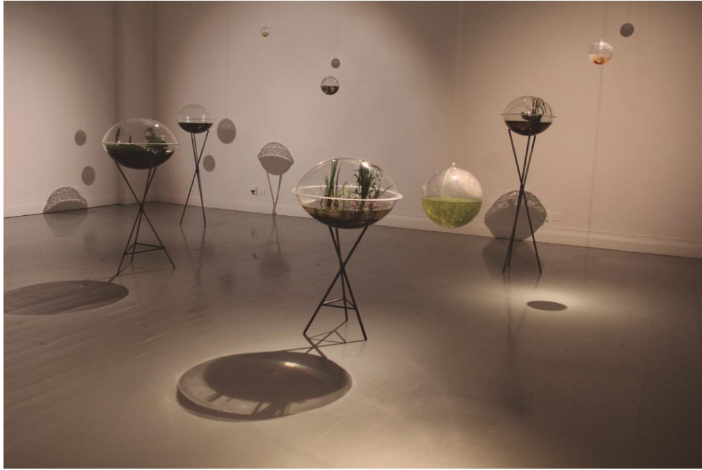
Göteborg Biennale, Sweden – 2013