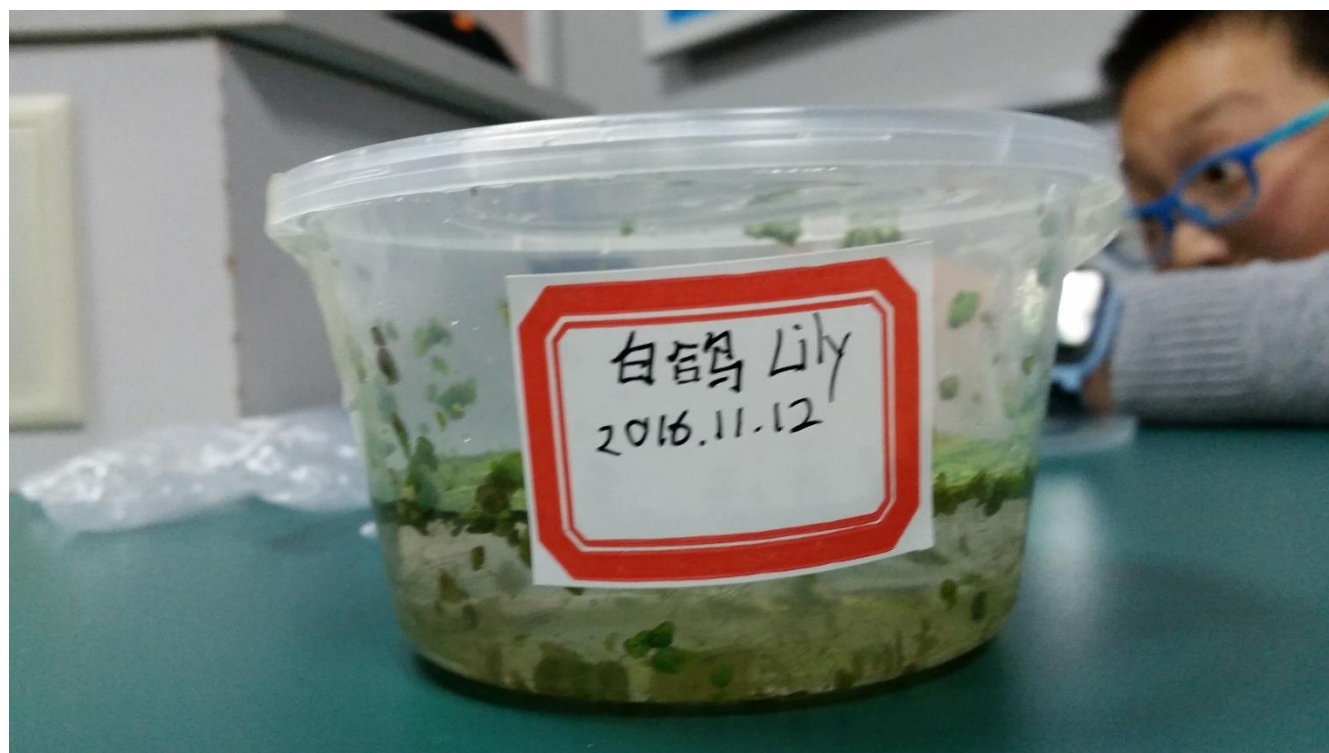
School in Wuhu, China, 2016