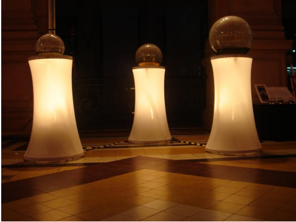
Exhibition – Canada Day, July 2008, Buenos Aires, Argentina