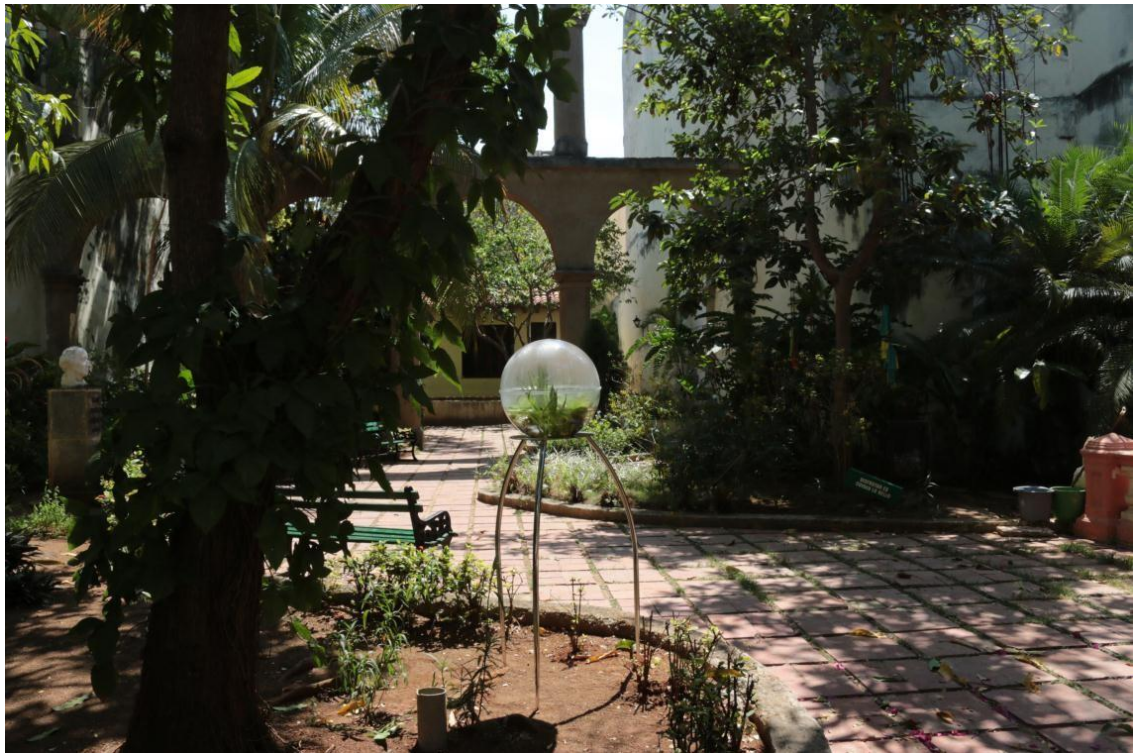
The Havana Biennial, Cuba 2015