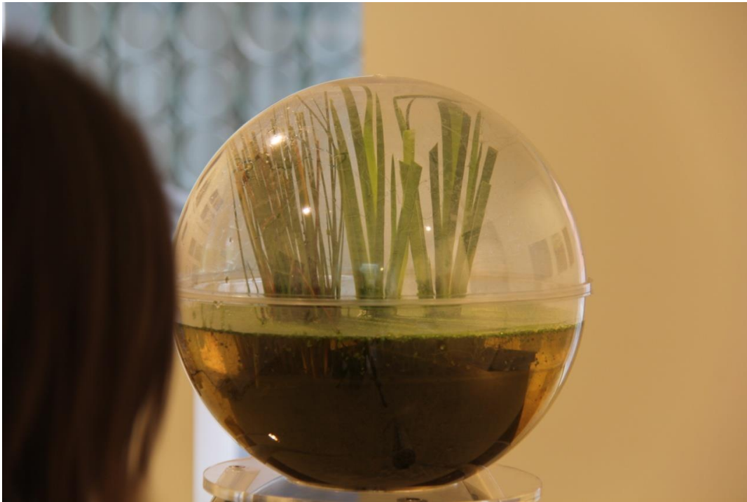
Göteborg Biennale, Sweden – 2013