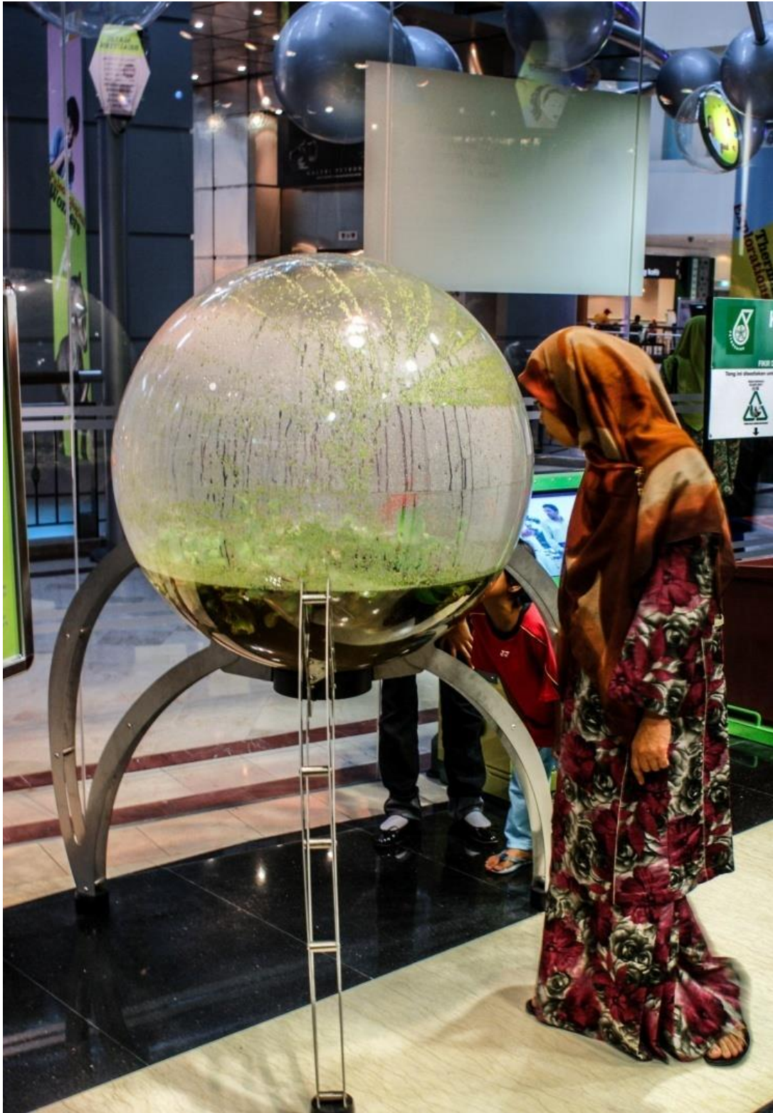
Petrona Towers, Kuala Lumpur, Malaysia, 2008