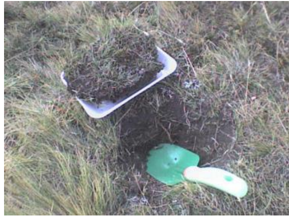
Ecosystem from a hill in front of the sea