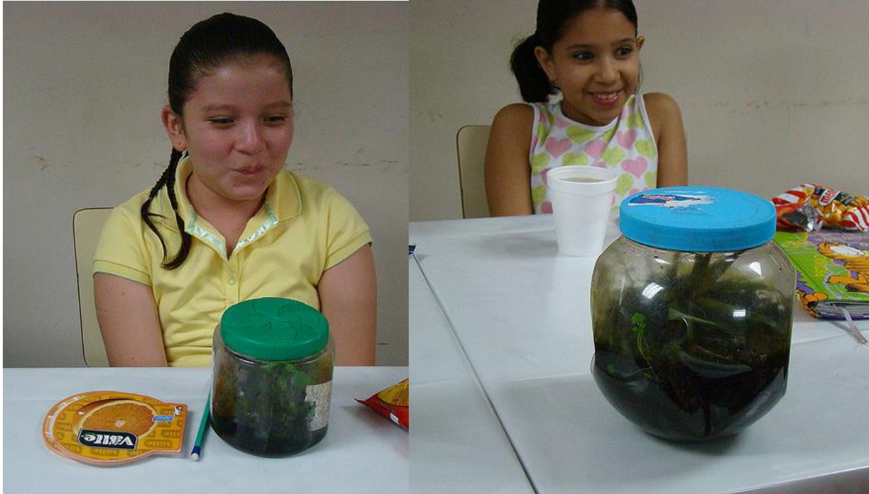
Educational Biosphere Program in Costa Rica