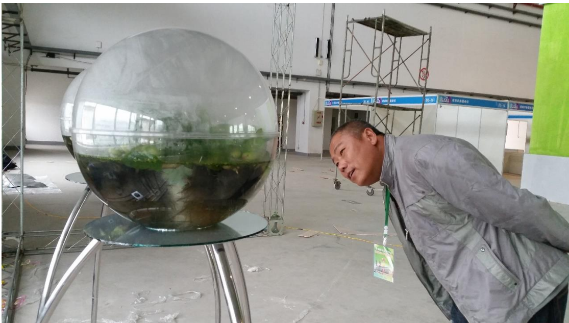
Art and Science Fair, Wuhu, China, 2016