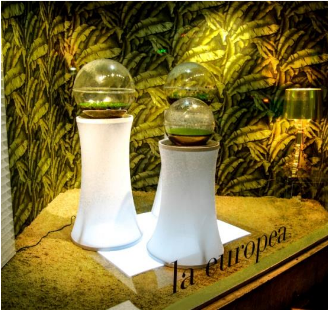
Exhibition – Gallery Nights 2008, La Europea, Buenos Aires, Argentina