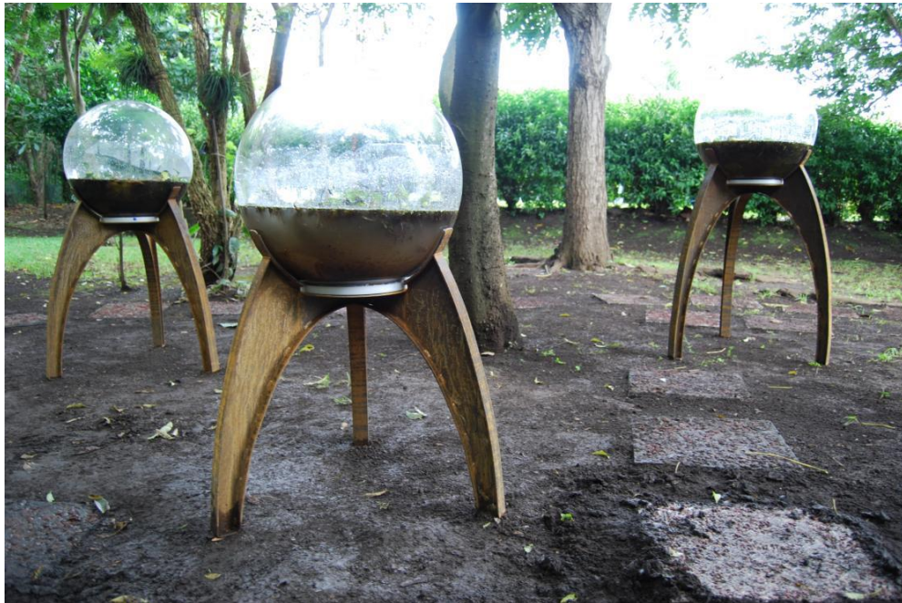
Exhibition at InbioParque Costa Rica, 2007