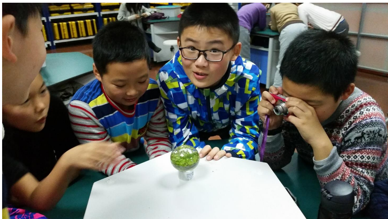
School in Wuhu, China, 2016