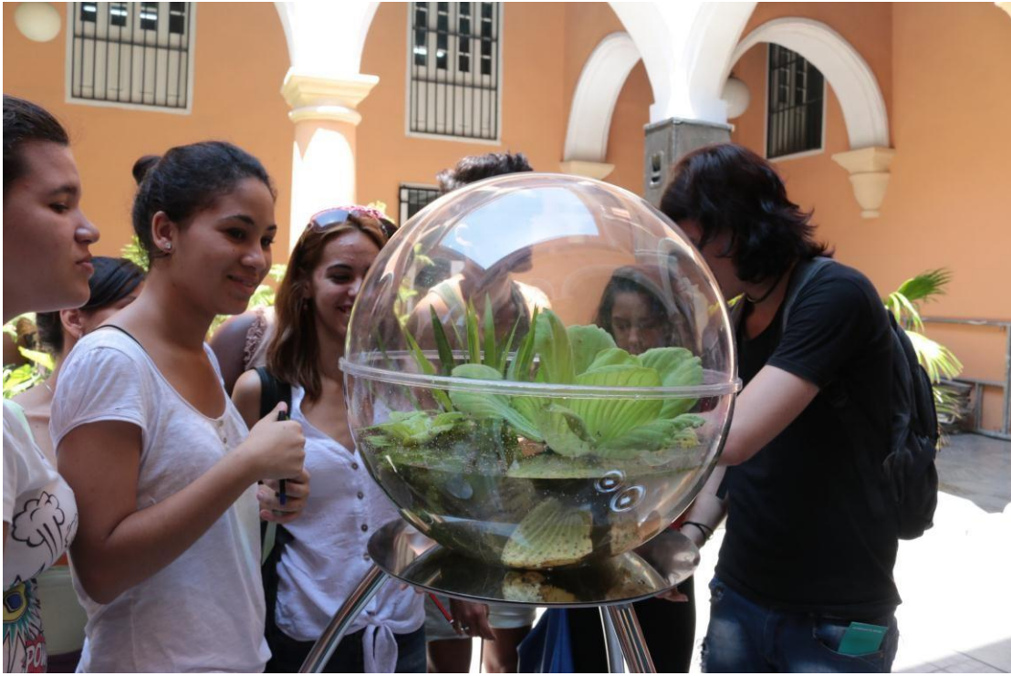
The Havana Biennial, Cuba 2015