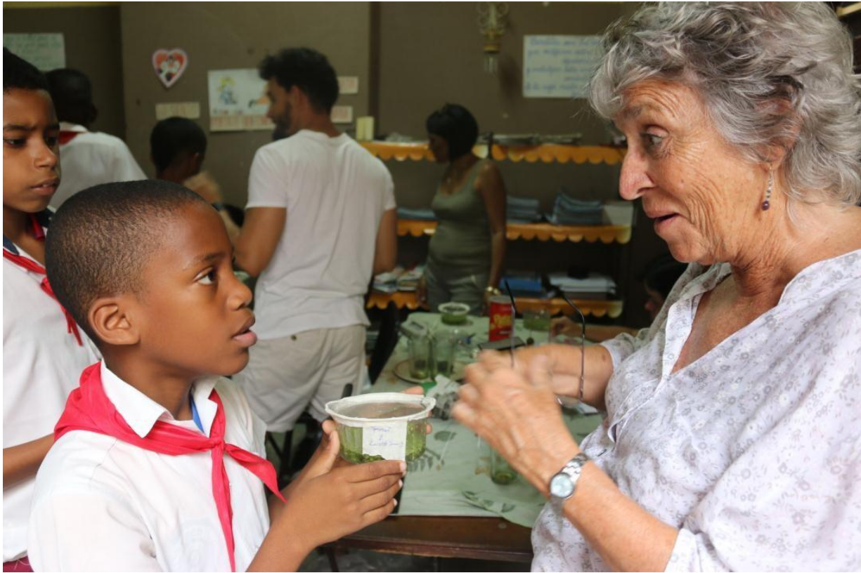
School in Havana, Cuba 2015